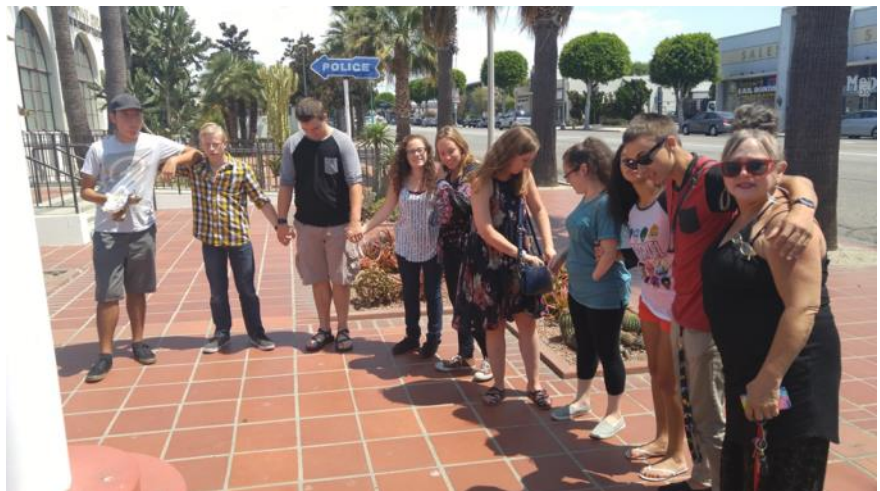
PPC Youth Praying in front of the Fullerton PD August 2016

It's true that we never know how God will respond to our prayers. Yet, we can confidentially pray for His will to be our will. When we do that we are participating in His good works that He has been planning all along.